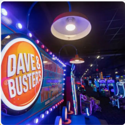
DAVE & BUSTERS