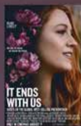
IT ENDS WITH US FRI NOV 4 6:30 p.m. [PG-13]