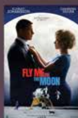
FLY ME TO THE MOON FRI NOV 15 6:30 p.m. [PG-13]