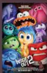
INSIDE OUT 2 SAT NOV 2 3:30 p.m. [PG]