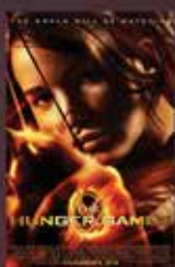
THE HUNGER GAMES SAT NOV 16 6:30 p.m. [PG-13]