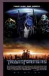
TRANSFORMERS SAT NOV 23 6:30 p.m. [PG-13]