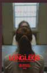
LONGLEGS FRI NOV 8 6:30 p.m. [R]