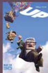
UP SAT NOV 23 3:30 p.m. [PG]