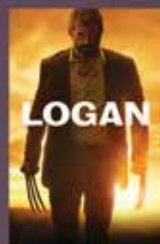
LOGAN SAT NOV 9 6:30 p.m. [PG-13]