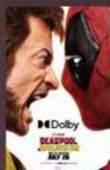
DEADPOOL & WOLV... SAT NOV 2 6:30 p.m. [R]