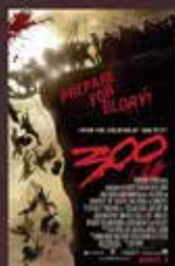
300 FRI NOV 22 6:30 p.m. [R]