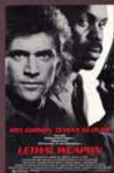
LETHAL WEAPON FRI NOV 29 6:30 p.m. [R]