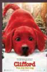
CLIFFORD THE BIG... SAT NOV 16 3:30 p.m. [PG]