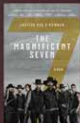
THE MAGNIFICENT... SAT NOV 30 6:30 p.m. [PG-13]