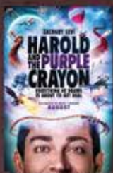
HAROLD AND THE PUR... SAT NOV 30 3:30 p.m. [PG]